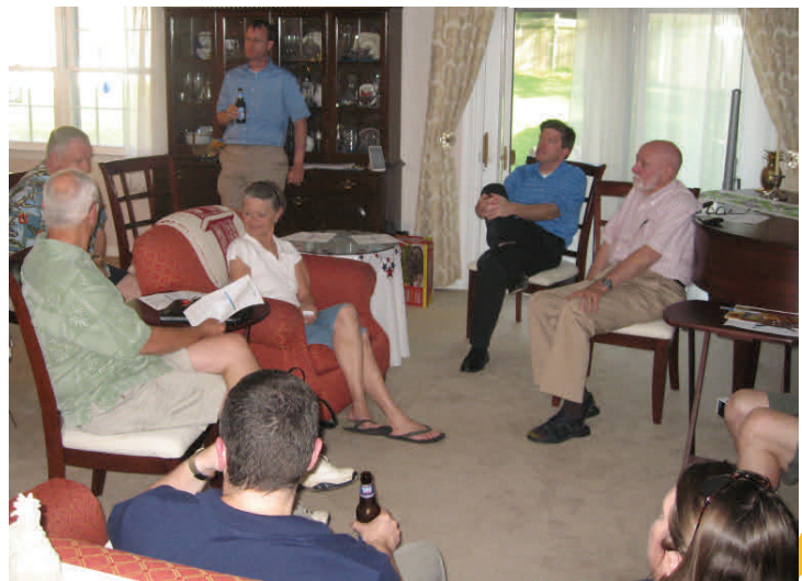
Attendees at the orientation converse on important SAR topics.

Many questions about insignia, Color Guard, program activities and the work of the SAR were covered... but there's always another question to ask! We would like to hold another informal session in Fall, so keep an eye out for more information! This session is geared toward new Compatriots, or those who are interested in reactivating their membership.