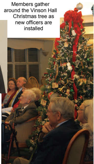
Members gather around the Vinson Hall Christmas tree as new officers are installed