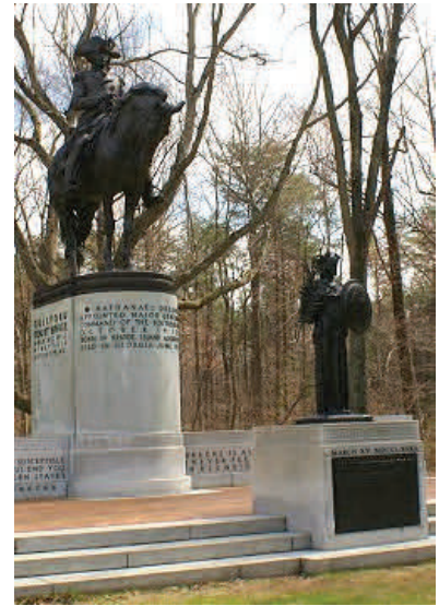
The Nathanael Greene Monument

Resolves as well as the Mid-Atlantic District.