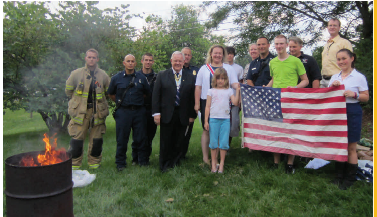
The C.A.R. participants with a Great Falls Volunteer Firefighter who participated in the flag retirement ceremony.